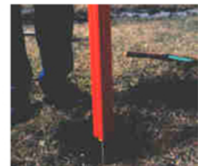
Finned sleeve placed over rod, filled with grease & s.s. datum point added