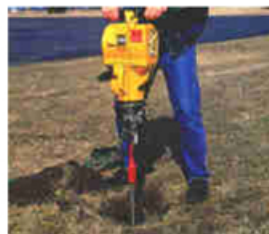
Rod monument driven to refusal, until top is about 6" below surface