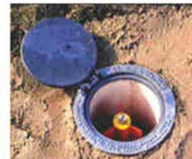
The finished mark - a well protected first-order bench mark.