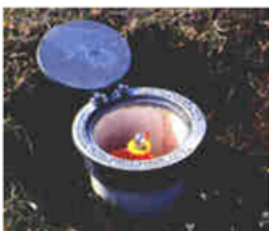
A 6" PVC pipe with access cover glued on, is placed over the finned sleeve. Hole & pipe are backfilled with sand.