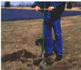
A 12" hole is augered to a depth of about 3.5 ft