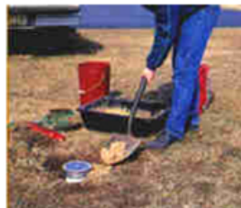
Top 12" is back-filled with concrete